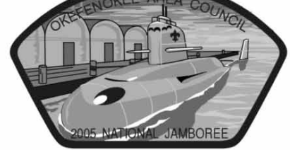
National Jamboree Quantity = _____