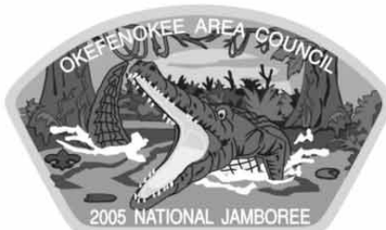
National Jamboree Quantity = _____