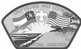
National Jamboree Quantity = _____