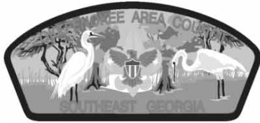
New Council Shoulder Patch Quantity = _____