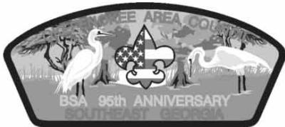
BSA 95 th Anniversary Quantity = _____