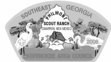
Philmont Scout Ranch Quantity = _____