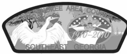
100 th Anniversary BSA Quantity = _____